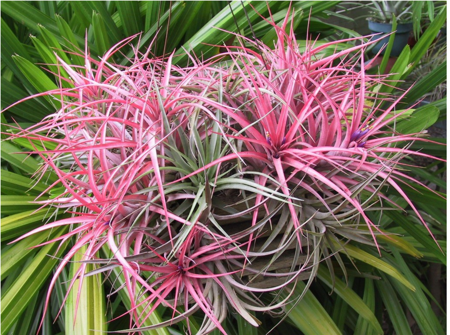
Multiple tillandsias

Correction: The picture on the cover of the May 2013 SCURF was not a Hohenbergia, it was a Guzmania "Ice Cream".